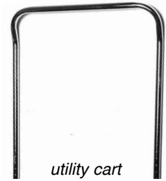
utility cart handle