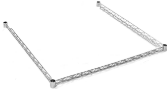
3-sided double truss frame