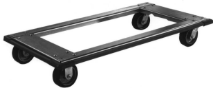
aluminum truck dolly

Includes designated casters and wraparound bumpers. Poly tread.