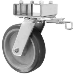
swivel/lock plate caster