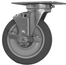
stainless steel pressure-washable caster (with brake)