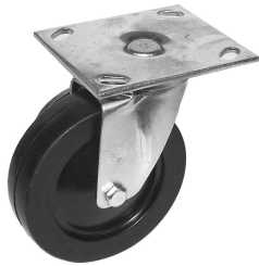
resilient plate caster

* See charts for complete model numbers.