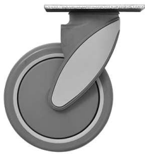
polymer plate caster