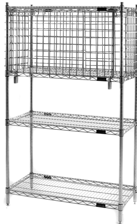
security module with flip-up door

(security modules shown assembled to wire shelf units)