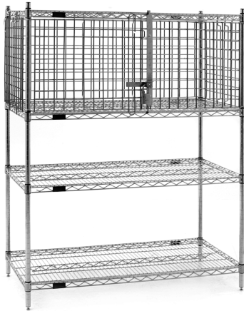
security module with hinged doors

Eagle Security Modules, model _____ (EAGLEbrite® zinc, Chrome, Valu-Gard® epoxy, EAGLEgard® epoxy, Stainless Steel) finish. Includes door(s), end panels, and rear panel. Available with hinged doors or single flip-up door. Fits in between two wire shelves that are spaced 20" apart.