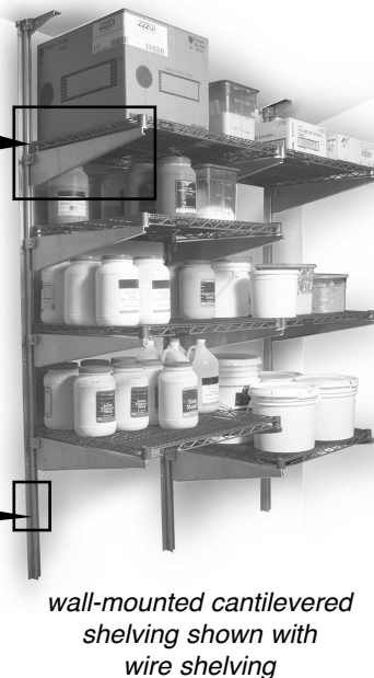
wall-mounted cantilevered shelving shown with wire shelving