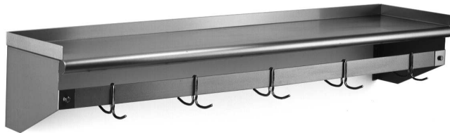
wall shelf with rack

Eagle Wall Shelf with Removable Hooks, model _____ . Shelf is constructed of 16 gauge type 430 stainless steel, with 1½" roll on front and 1½" upturn on rear and ends. 2" x ¾" type 304 stainless steel flat bar. Furnished with double-prong stainless steel removable hooks, one every 12".