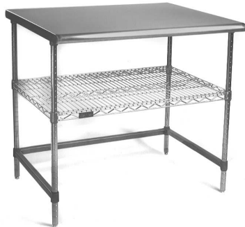
...with C-frame base and wire shelf