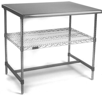
adjuSTable® with H-frame base and wire shelf...

Eagle AdjuSTable® Work Surface System, model _____. Heavy gauge (brushed, electropolished) stainless steel top with choice of base combination: one wire undershelf and one C-frame or H-frame, or two C-frames or H-frames. Four 33" front posts. Wire undershelves feature patented QuadTruss® design (patent #5,390,803).