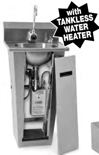
hand sink with hot water heater