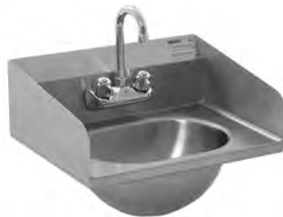
hand sink with optional end splashes