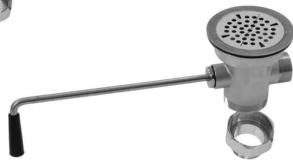
twist handle drain