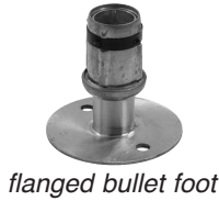
flanged bullet foot