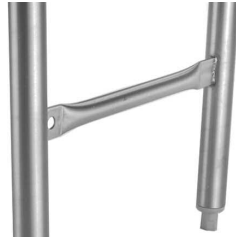
crossbraced legs with stainless steel feet