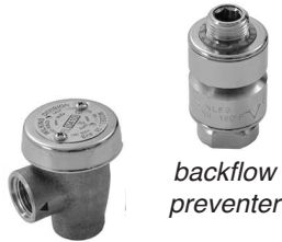
anti-siphon vacuum breaker