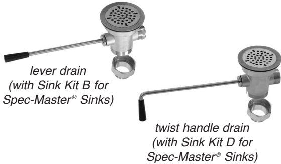
lever drain (with Sink Kit B for Spec-Master® Sinks)