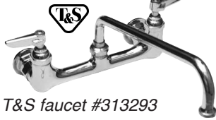
T&S faucet #313293