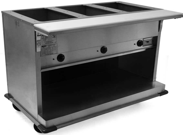
unit with open front

Eagle Hot Food Tables, Spec-Master® series, model _____ enclosed base design. Top and body are heavy gauge type 430 stainless steel (Open Front or Sliding Doors). Beaded top openings are 12½" x 20½". Heating compartments are 8" deep, galvanized, and insulated on all four sides and bottom with 1" fiberglass or equal. Recessed control panel with individual thermostatic controls. Each compartment fitted with 750-watt tubular heating element above the insulated bottom. 6' cord and plug. Complete unit wired to master toggle switch with indicator light. Furnished with polyethylene cutting board. Includes 5"-diameter swivel plate casters (two with brake).