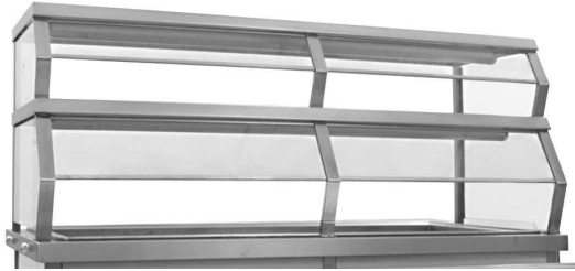
double tier sneeze guard