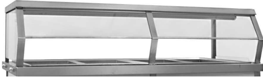
single tier sneeze guard

* See charts for complete model numbers.