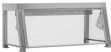
tilt/adjustable sneeze guard