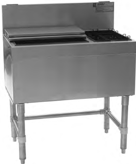
19" wide (483mm) unit

Eagle Spec-Bar® Combination Ice Chest, model _____. Heavy gauge type 304 stainless steel body, legs, leg channels and cross rails. Ice chest to be 10½" deep standard, with foamed-in-place insulation, non-metallic breaker strip to prevent heat transfer, and stainless steel sliding cover. Ice chest and bottle racks to have separate compartments and drains. ¾" x 2½" rectangular slots in top of backsplash for tubing. Stainless steel adjustable bullet feet. (2 or 8) circuit post mix sealed-in cold plate available.