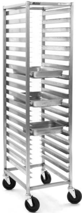
single-width stainless steel rack

Eagle Panco Stainless Steel (Single Width or Double Width) Racks, model _____. Stainless steel construction with 1" square tubular frame and supports all-welded. 16/304 stainless steel tray slides 1½" x 1" riveted to vertical uprights. 3" slide spacing to accommodate a variety of pans or trays. Furnished with 5"-diameter casters. Unit shipped assembled.