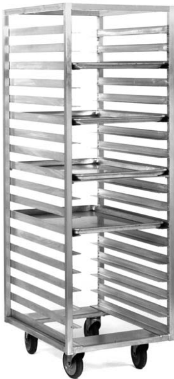
roll-in refrigerator rack

Eagle Panco® Roll-In Refrigerator Rack, aluminum model _____ . Frame, corner uprights, top and bottom constructed of 1" square aluminum tubing. 1 1/8" x 1 1/8" extruded aluminum tray slides with raised beads to minimize friction. Slide spacing to be 2 1/4", 3", or 5" to accommodate (24, 18, 11, or 36) trays. Furnished with 5"-diameter casters. Shipped assembled. Note: Model #UARR-64-A comes with 12 universal angle slides, accommodating a variety of pan/rack sizes.