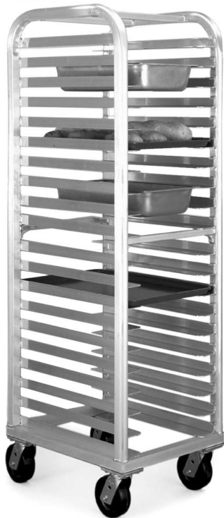
LIFETIME Series universal pan rack

Eagle LIFETIME Series Universal Pan Rack, model _____ . Constructed of heavy duty 6063-T5 aluminum alloy. Fully welded frame, 1" square tubular crossbracing, base consists of 1½" x 1½" square aluminum tubing with pretapped caster plates welded inside, and 3¼"-wide aluminum slides welded to frame. Lifetime guarantee against rust, corrosion, workmanship and material defects.