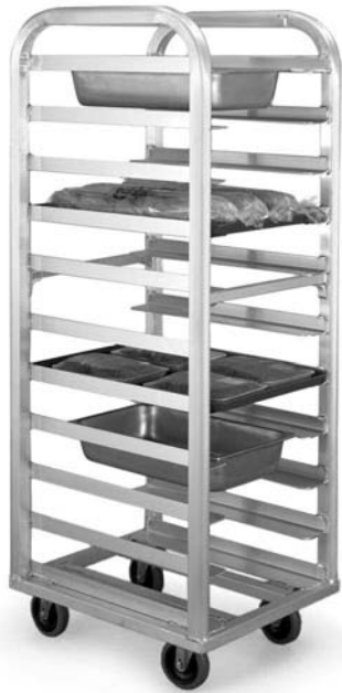
LIFETIME Series universal roll-in rack

Eagle LIFETIME Series Universal Roll-In Rack, model _____. Constructed of heavy duty 6063-T5 aluminum alloy. Fully welded frame. 1" square tubular crossbracing. Base consists of 1½" x 1½" square aluminum tubing with pretapped caster plates welded inside. ¾" wide angle slides welded to uprights. Heavy duty 5" x 1½" non-marking swivel casters.