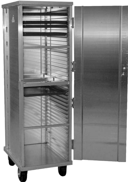
LIFETIME Series enclosed pan rack

Eagle LIFETIME Series Enclosed Pan rack, model _____. Constructed of heavy duty 6063-T5 aluminum alloy. Fully welded construction includes top and interior bracing with bottom frame. Side panels welded to uprights, top bracing and bottom frame. 1/2" wide angle slides, door is 1/8" thick aluminum mounted on four stainless steel hinges and 6" x 2" non-marking swivel plate casters. Lifetime guarantee against rust, corrosion, workmanship, and material defects.