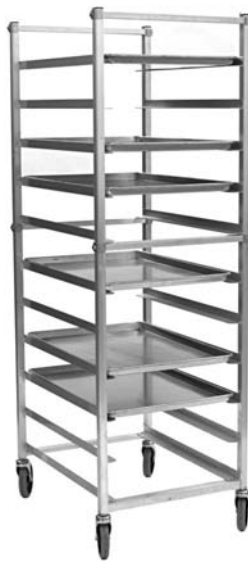
18 series rack

Eagle Panco® 18 Series Deluxe Pan Rack, stainless steel model _____. Stainless steel frame and cross supports are 1" square stainless steel tubing with all-welded construction. Slides are heavy gauge stainless steel, 1½" with raised bead to minimize friction, riveted to vertical uprights. Slide spacing to be 5", 3", or 2¼" to accommodate (11, 18, 20 or 24) full size sheet pans. Units feature front-to-back and side-to-side crossbracing. Furnished with 5"-diameter swivel casters. Shipped assembled.