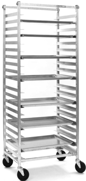
26 Series rack

Eagle Panco 26 Series Pan Rack, stainless steel model _____ . Stainless steel construction with 1" square tubular frame and cross supports. 1⅞" x 1⅞" stainless steel tray slide with a raised bead edge riveted to stainless steel vertical tube. Slide spacing to be 5", 3", or 2" to accommodate 11, 18, 20, or 30 full size sheet pans. Furnished with 5"-diameter casters. Unit shipped assembled.